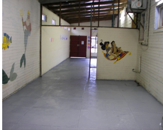
New Classroom floor sealed and painted to get rid of cement dust from 60 year old floor. 2009

We would like to see our supporters pick an item to support over the next year. If you would like to specify where your donation is allocated, let us know. Below are some of the needs that we are aware of.