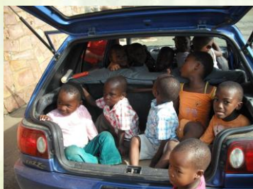
Going on a school trip! (How many children will fit into a little car?)