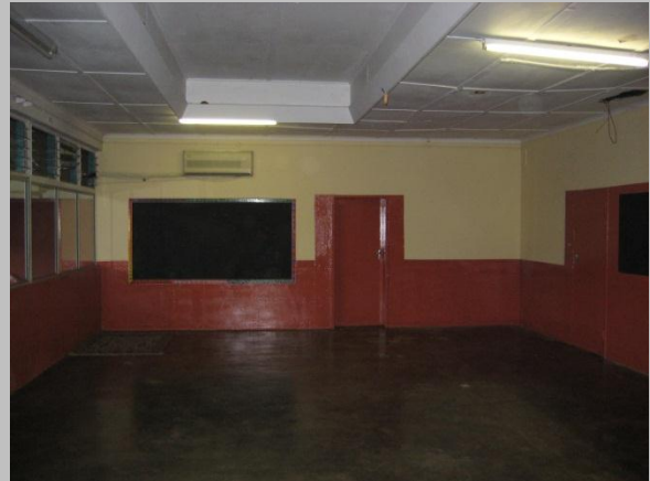
THE REPAINTED HALL

The first thing that the children do when they are in the classroom is to have a time of prayer, where they are able to pray for their needs. Some of the children prayed for winter clothing. God answered their prayers by providing a donation of used clothing. There were enough winter items for the children who needed clothing. I am sure this boosted their faith in our Almighty God. Other children have prayed for healing, and have testified the following day that they were healed. Praise god!